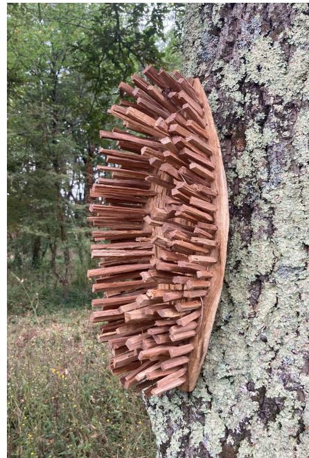
Sintropic fertility 2023 Oak timber 38 x 24 x 15 cm