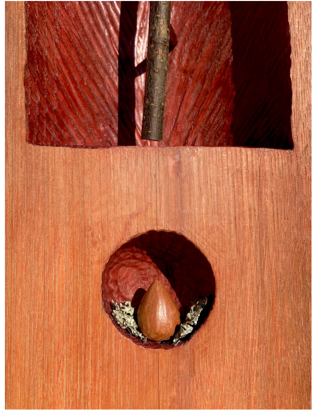
Conception - details