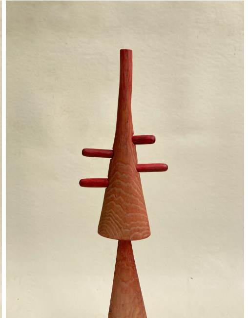
I am you 2024 Chestnut timber, dyes 70 x 18 x 12 cm