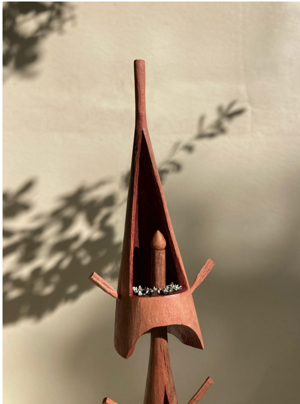
Transmission of life - details