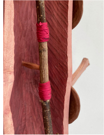
One single and only life 2024 Sycamore timber, grafting of hazel timber and maple timber, terra-cotta 52 x 26 x 9 cm