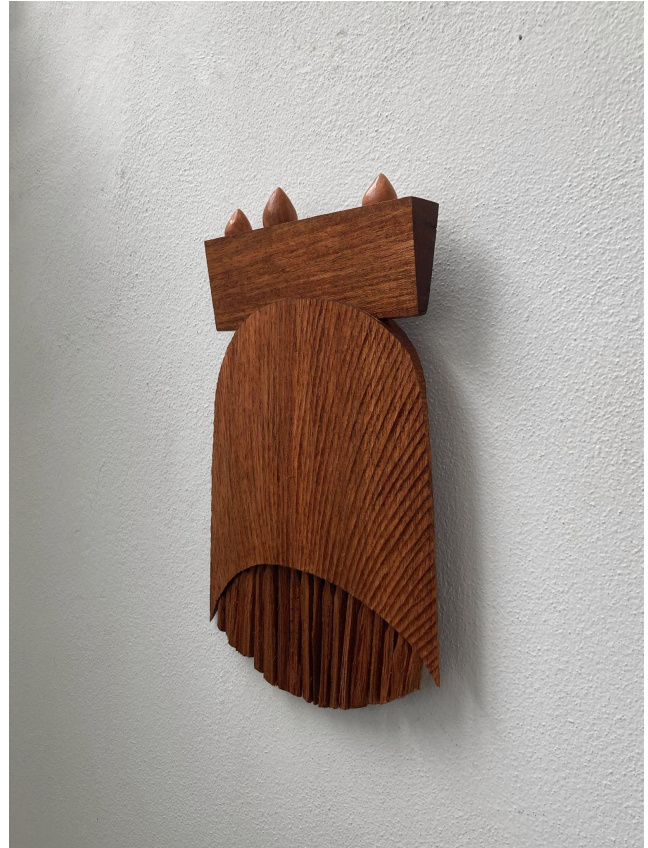
Evolutionary past and then us 2024 Utile timber, wood-fired wild clay 28 x 20 x 7 cm