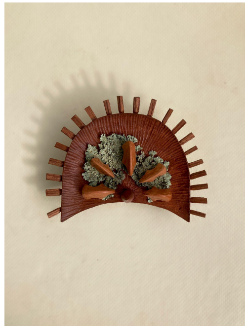
Nativity scene of all life forms 2024 Utile timber, lichen, dyes, wood-fired wild clay 24 x 20 x 15 cm